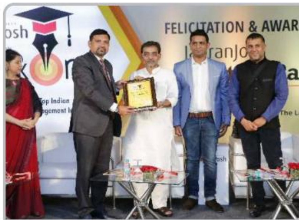
Top Management Institute in Western Region - Jagran Josh