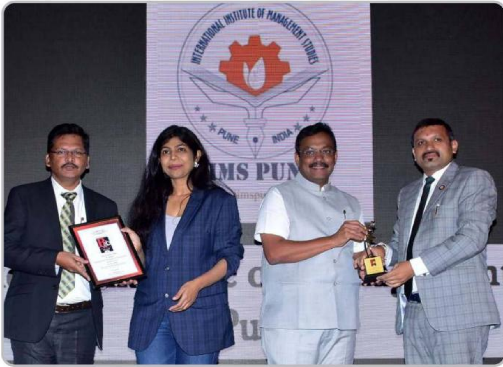
"Best Education Brands 2018" - The Economic Times