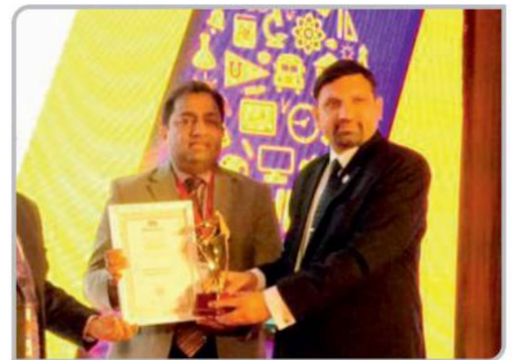
Education Leadership Award - BBC Knowledge