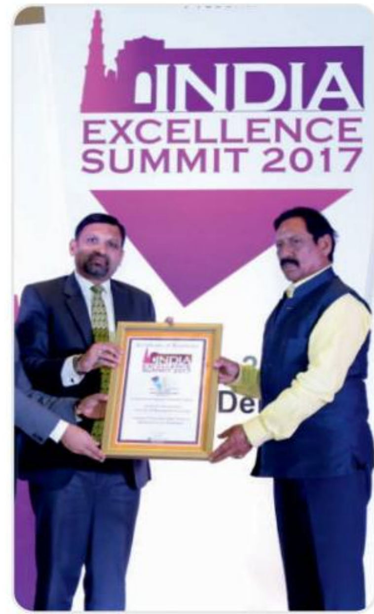
Leading Private 'B' School in Maharashtra for Placements - Award by Brands Academy