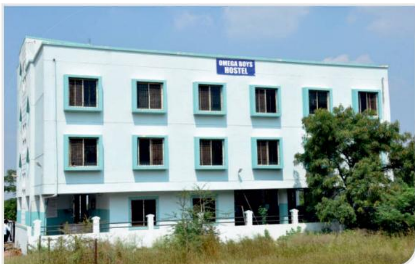
OMEGA BOYS HOSTEL