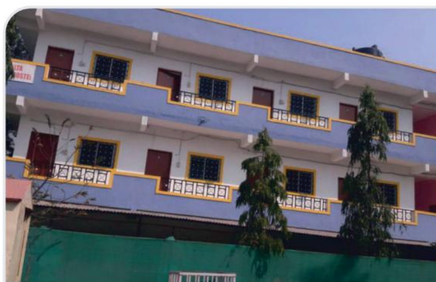
DELTA GIRLS HOSTEL

Our campus is residential hence modern residential facilities are available for the students. There are 4 separate well-furnished and well designed hostels for girls & boys with all best facilities for the students. It is mandatory for boys & girls to stay in the hostel for First year, Local students or students who wish to stay with local guardian must seek necessary NOC from the Director-IIMS. Hostel accommodation is available on twin and triple sharing basis. Allotment of accommodation for the boys students is on first come first served basis.