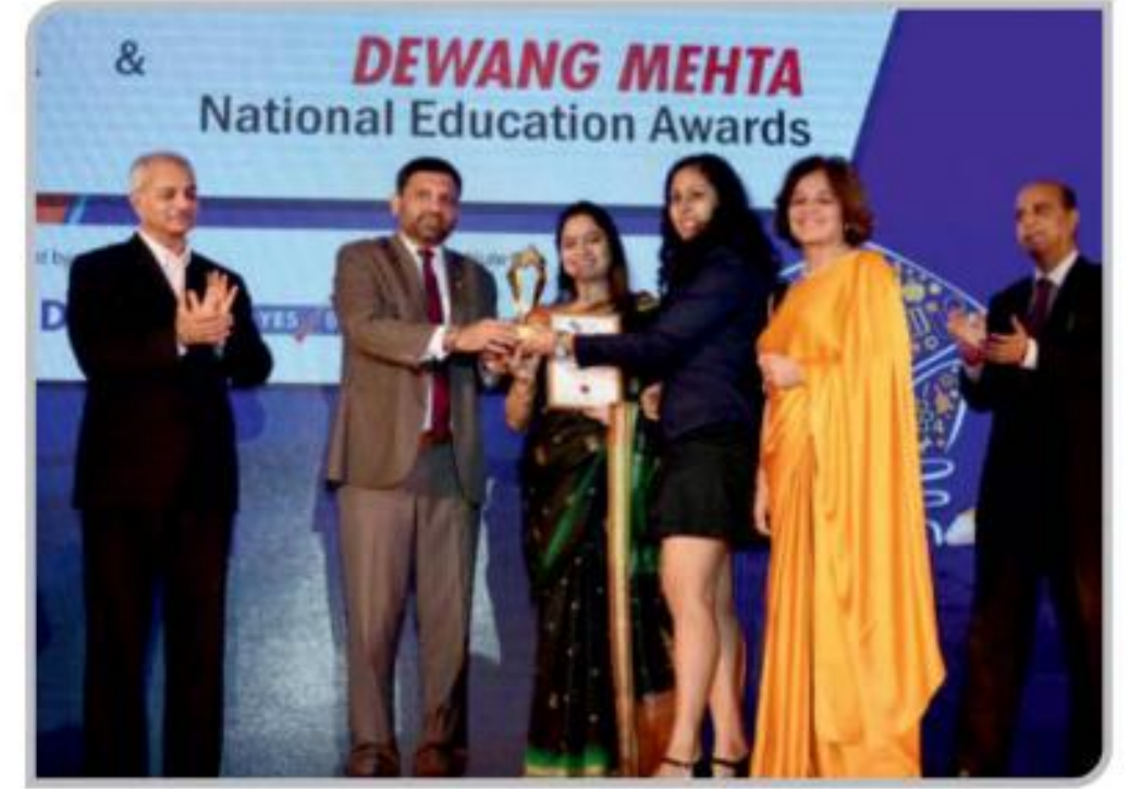
Dewang Mehta National Education Award