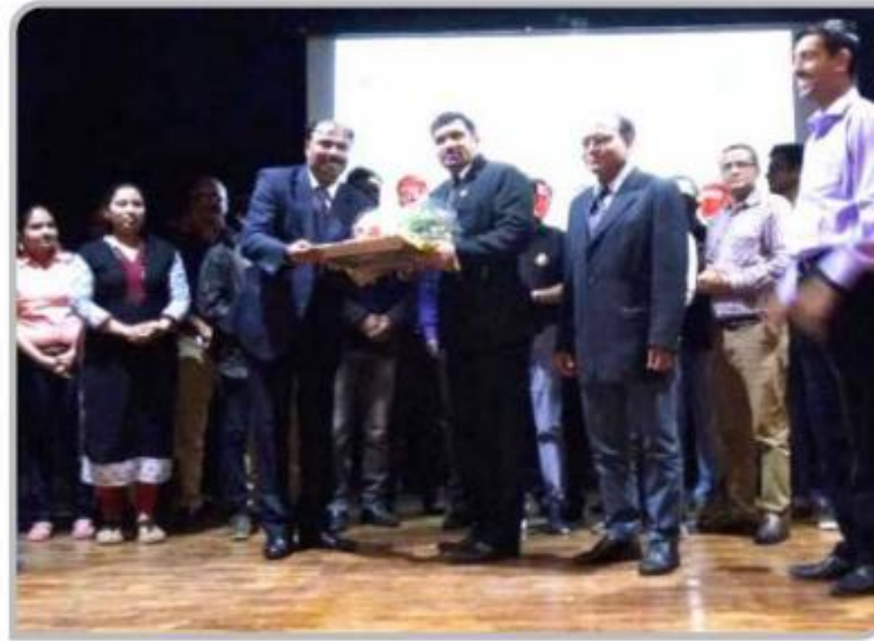
Institute with Best placements - GIC