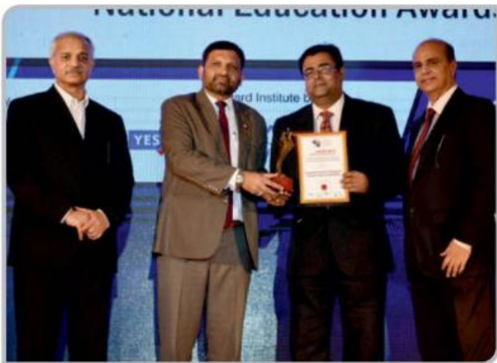
Contribution Through Education in Women's Empowerment Award - Dewang Mehta National Education Award