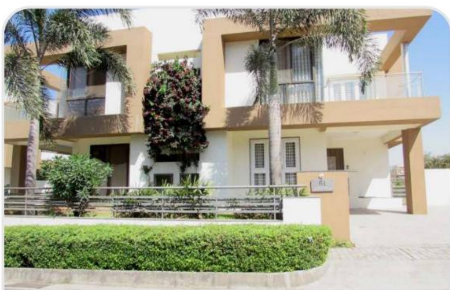
LIFE EPUBLIC GIRLS HOSTEL