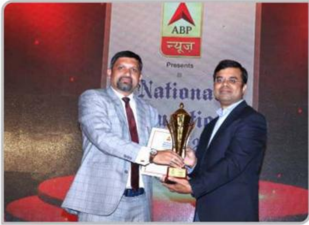
Institute with Best placements - ABP News