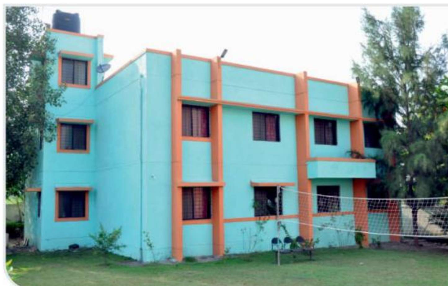
BETA GIRLS HOSTEL